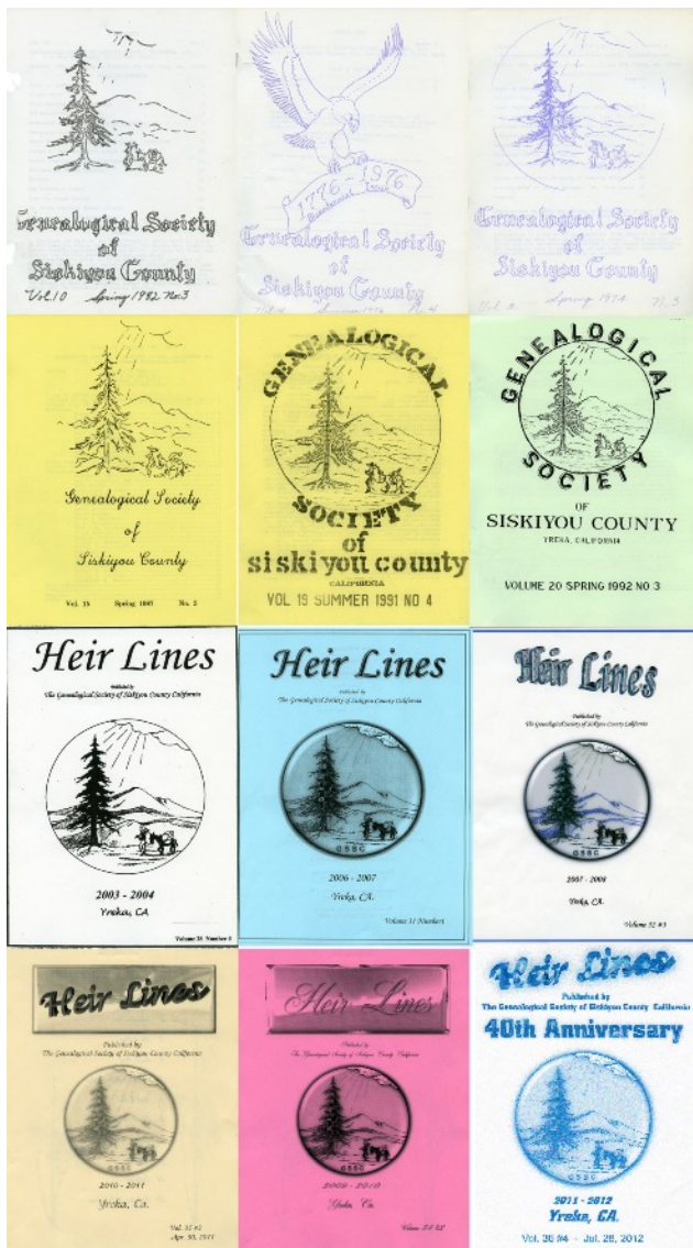
Heir-Line covers from the past.

The next meeting will be a workshop held at 8 p.m. on June 30 in the Siskiyou County Library, with regular meeting dates falling on the last Friday of each month.