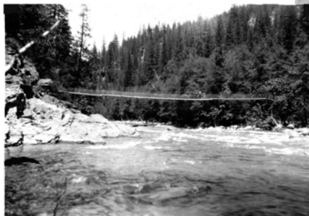
Building of the Bridge at F. O. E. Camp Grounds on the Scott River, CA. Date unknown