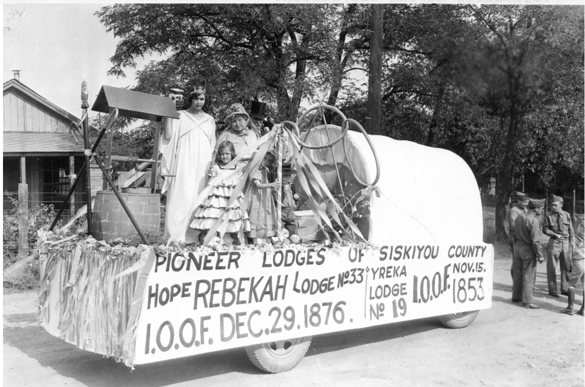
Parade in Yreka - Early 1940's