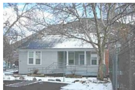
Siskiyou County Genealogical Society