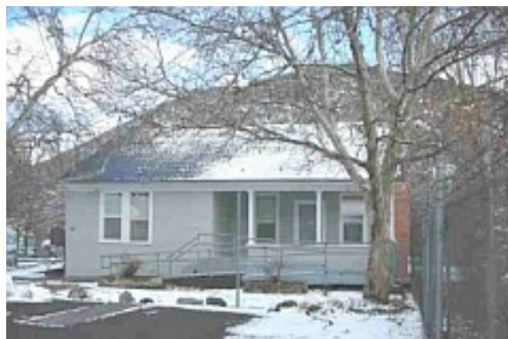
Siskiyou County Genealogical Society